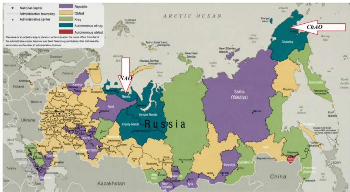
Figure 1. Political map of Russian Federation. (Available at: https://www.maps-of-the-world.ru/europe/russia/large-scale-administrative-divisions-map-of-russia-2009 ).

populations of which are 44.1 and 50.7 thousand people, and the densities are 0.25 and 0.07 people/km 2 , respectively (as of 1 January 2020). In addition, with extreme climatic conditions, underdeveloped social and economic infrastructures are common to both regions. Their difference lies in the leading type of economic activity. In NAO, the economy is based on the extraction of oil and natural gas, whereas the extraction of hard and brown coal, alluvial and ore gold, and other nonferrous metal ores prevail in ChAO. Despite the noted difficulties in terms of the size of the gross regional product per capita in 2018, NAO ranked first (6288.5 thousand rubles) and ChAO ranked fifth (1386.1 thousand rubles) in Russia [1,2].