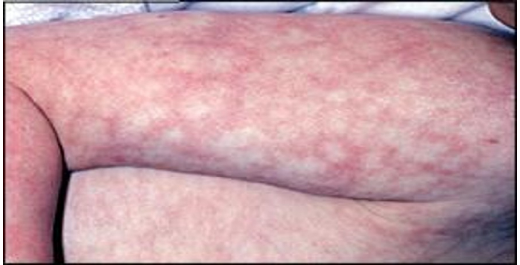
FIGURE 3: Rashes on patient's right arm