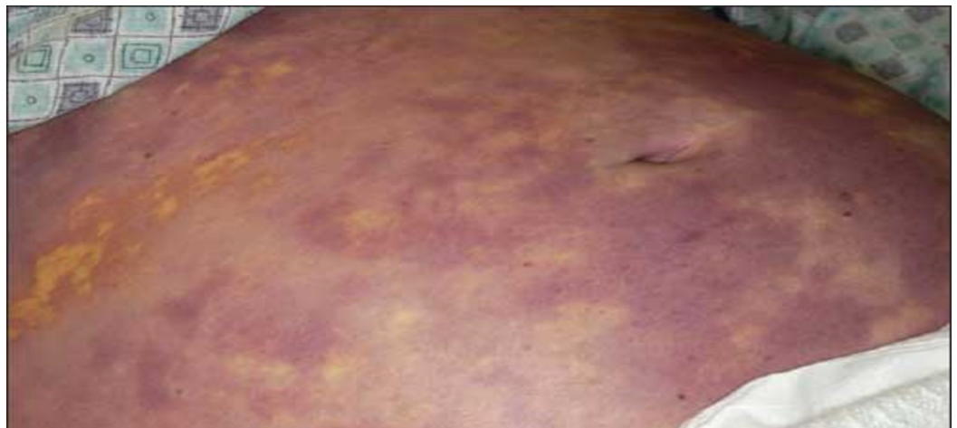
FIGURE 2: Rashes on patient's abdomen