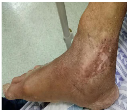
DOI: 10.12998/wjcc.v10.i23.8224 Copyright ©The Author(s) 2022.