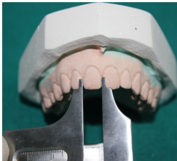
Figure 1 Measurement of mesiodistal width of central incisor.

Inclusion criteria were >18 years old; either Aryan or Mongoloid; born in Nepal; with an Angle Class I molar relationship, pleasing profile, and intact morphologically normal permanent dentition up to the second molar. Subjects with a history of orthodontic treatment; a Class II or Class III molar relationship; gingival inflammation and hypertrophy in the upper anterior region; severe attrition; crowns or proximal restorations placed in the anterior teeth; and a history of congenital anomaly, orbital disease, trauma, or facial surgery were excluded.