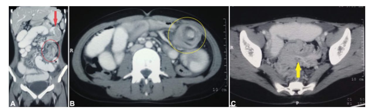
Fig. 1 Contrast-enhanced computed tomography of the abdomen showing (A) jejunojejunal intussusception (marked with red arrow) and ileoileal intussusception (circled with red) in coronal section, (B) ileoileal intussusception (circled with yellow) in sagittal section, and (C) colocolic intussusception involving sigmoid (yellow arrow) in sagittal section.

After obtaining consent, patient was taken up for emergency exploratory laparotomy. All three intussusceptions were reduced without any complications. Bowel wall was mildly edematous without any obvious signs of ischemia/necrosis. Multiple polyps in the jejunum, ileum, and sigmoid colon were found to be lead points ( Fig. 2 ). Jejunotomy and sigmoidotomy were done to remove the respective polyps. The ileal polyp was hemorrhagic in appearance, which was suspicious of malignancy. Since frozen section was not available at the time of surgery, an intraoperative decision was made to proceed with ileal resection with 5 cm margin proximal and distal to polyp. The specimens were sent for histopathological examination. Rest of the abdomen was examined and found to be normal. The