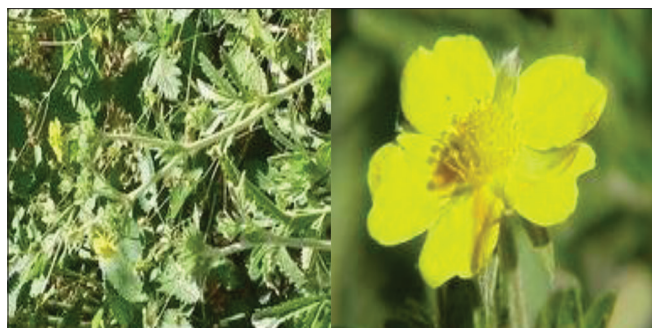
Figure 1: Potentilla fulgens : Whole plant and a flower

considering the ethnomedicinal use of this plant against diarrhea in Manipur, India, in this study, we were interested to investigate the safety and protective effects of P. fulgens root extract in experimentally induced diarrhea in mice.