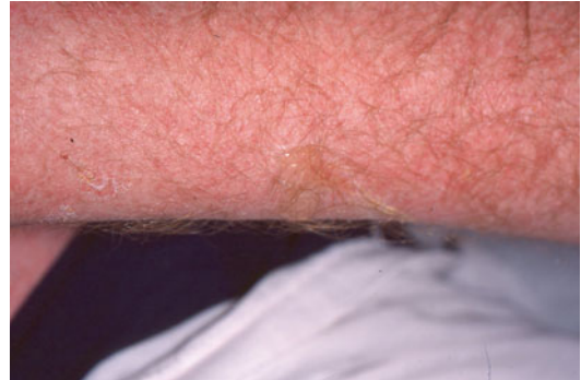
Fig. 24.2 Diffuse erythema over forearm with fragile blisters. The blisters on the left are already broken and the “wet cigarette paper” is on the lower border of arm just to the left of center

disease progression. In some cases, early lesions may be slightly infiltrated. Atypical targets with dark centers are also often seen. At this point in the evolution of SJS or TEN, lesions may mimic more benign drug-related disorders including exanthematous drug eruptions or EM major.