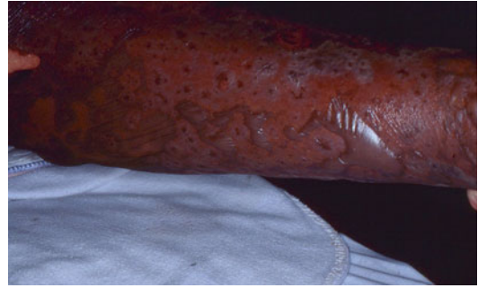
Fig. 24.5 Flaccid bullae and erosive papules over the forearm of a patient with TEN. The skin is being wiped away with a finger over the elbow, showing a positive Nikolsky's sign. The danger of not stopping the offending antibiotic early was the probable cause of end-stage pulmonary disease and death. The patient failed on high-dose intravenous corticosteroids, plasmaphoresis, and intensive topical therapy

of cases. The vermilion border of the lips and oral cavity frequently feature grey-white pseudomembranes and crusts overlying hemorrhagic erosions. Genital involvement (Fig. 24.4), often with associated dysuria, presents in 40–63 %, and may be complicated by dyspareunia, synechia formation, and urethral or anal strictures in rare cases.