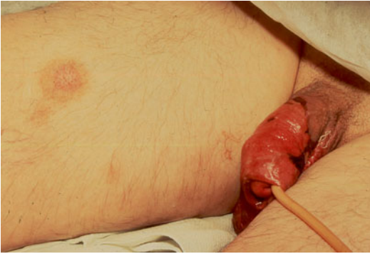
Fig. 24.4 TEN of the genitalia with dramatic stripping of epidermis of the glans and shaft of the penis. The base of the penis shows epidermal denuding, indicating a positive Nikolsky's sign. A urinary catheter has been inserted due to severe dysuria and urinary retention