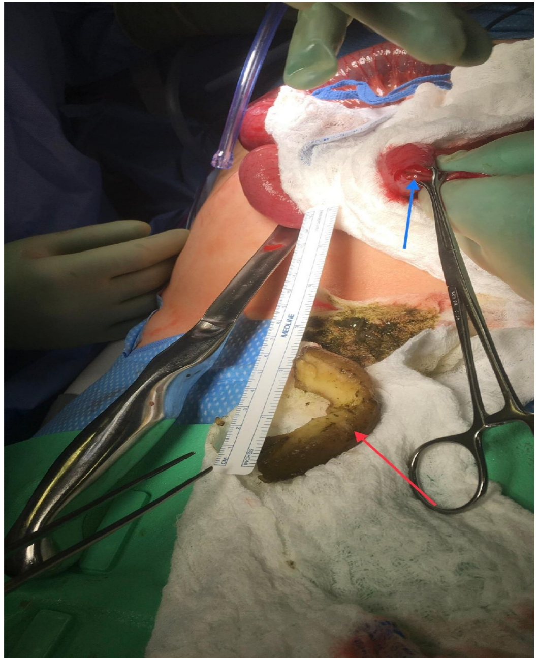
FIGURE 3: Exploratory laparotomy.