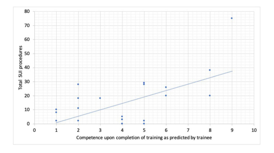
Fig. 3 Correlation between number of stress urinary incontinence (SUI) procedures logged by trainees and trainees self-assessed competence. This graph illustrates that trainees who were exposed to more SUI operations during training had greater confidence that they would be competent in this field by the time they had completed their training scheme

We have identified two concerning findings for urologists and urogynaecologists. The first is a decline in the rate of SUI