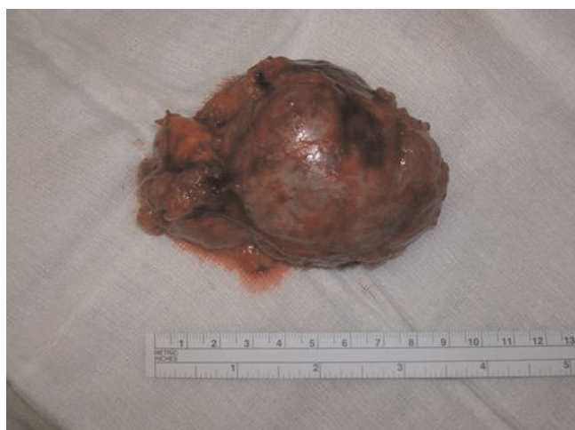
Figure 2. Macroscopic findings of the surgically removed tumour.