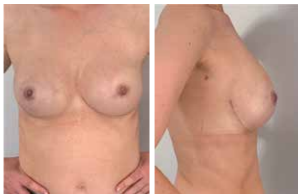
Fig. 2. A patient after bilateral pre-pectoral subcutaneous mastectomy

was noted in three women who were treated with postoperative radiotherapy. In four cases, tissue expanders were used instead of implants to prevent excessive tissue pressure. Skin flap necrosis was recorded in two patients after skin-reduction mastectomy (one of whom received radiotherapy) and in three patients after NSM (two of whom received radiotherapy, and one received chemotherapy). Skin flap necrosis necessitated the removal of the implant in two out of five patients with skin necrosis, i.e. one diabetic and one obese patient. Skin necrosis was observed in one diabetic patient treated with an expander, necessitating its removal. Full-thickness necrosis of the NAC was observed in one woman after SRM and in three following NSM. In 1 smoker necrosis was observed. An implant dislocation was noted in two patients after NSM (Table 4). In the non-cancer group, superficial necrosis around the areola was noted. In a multivariate Cox regression analysis