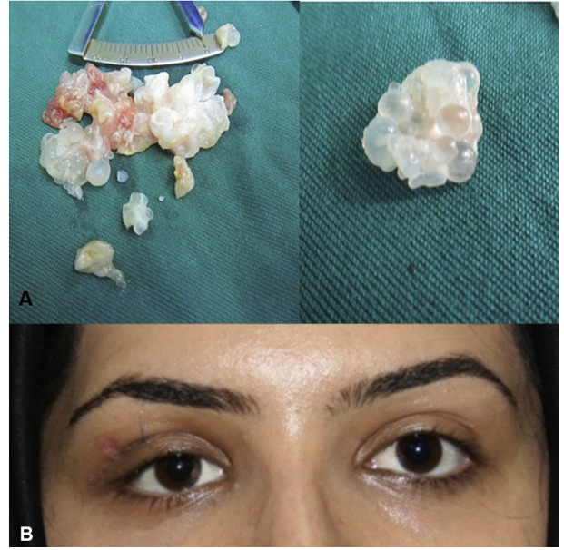
Fig. 3. The completely removed multiloculated hydatid cyst (A). Follow-up of the patient one week later (B). No recurrence was seen also at 1-year follow-up.

Surgical en-bloc excision of the cyst was performed on the patient to prevent cyst-rupture and dissemination of the cyst's content into the orbit (Fig. 3). Since the MRI showed that the lesion is extended up to orbital apex, we decided to use “deep lateral orbitotomy” in this patient. The surgeon was able to access the superior orbital fissure with a deep lateral orbitotomy.