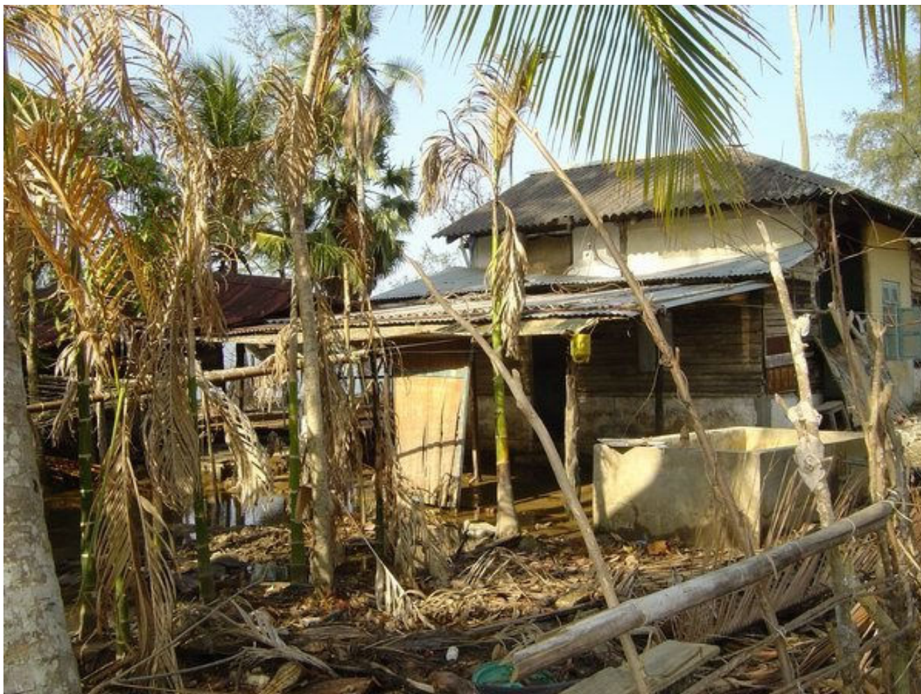
Figure 2 Photograph showing the destruction of areca nut and coconut groves due to seawater inundation.