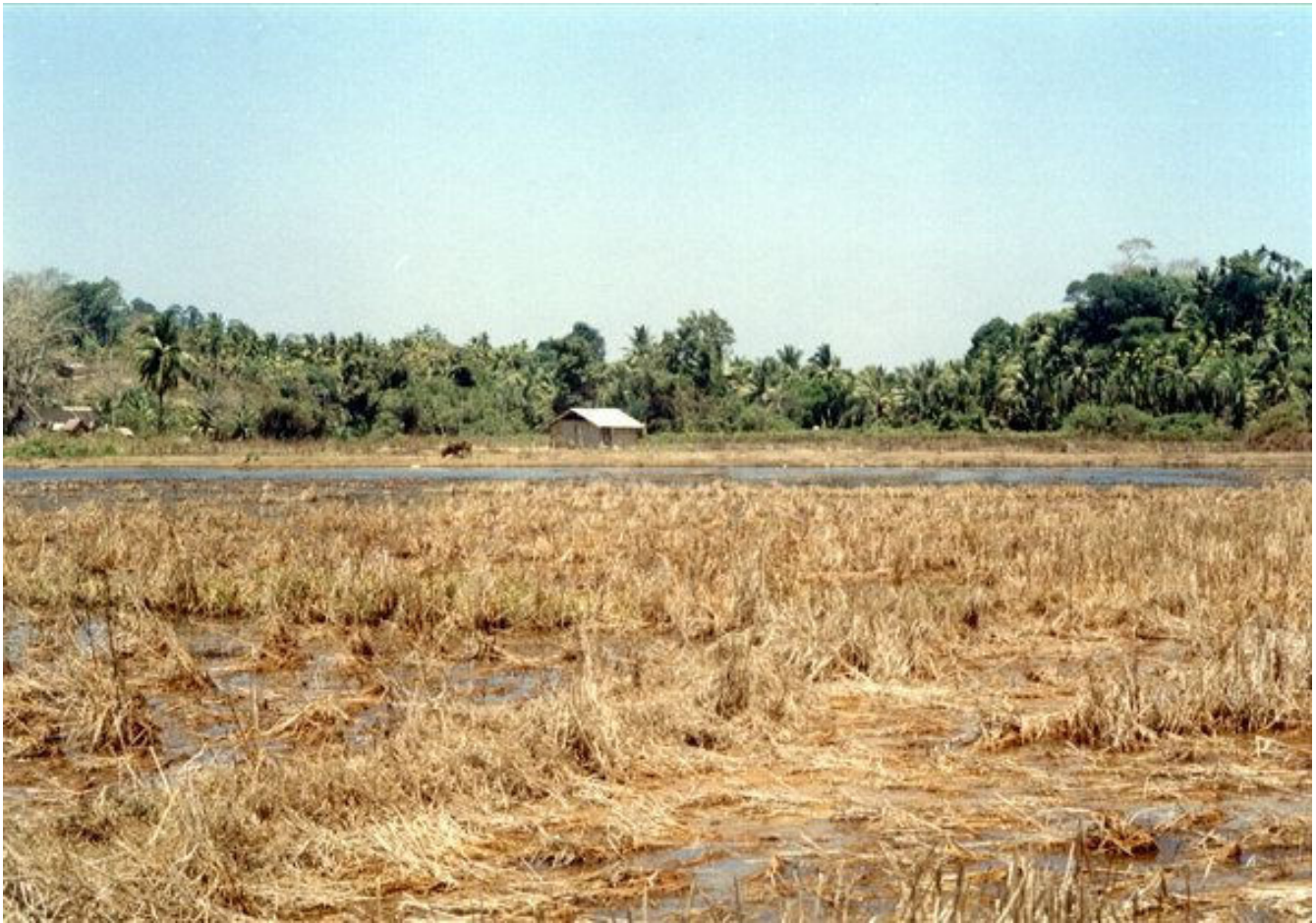
Figure 3 Photograph showing the paddy field flooded with seawater.

sites. In addition to its original breeding grounds of creeks and streams [13] in South Andaman, now its breeding has been extended to paddy fields and fallow lands flooded with seawater. Paddy fields and fallow lands with fresh water hitherto considered, as least potential sites for An. sundaicus are now a major breeding habitat due to saline water. Destroyed paddy fields are perhaps the first record of major breeding source for An. sundaicus .