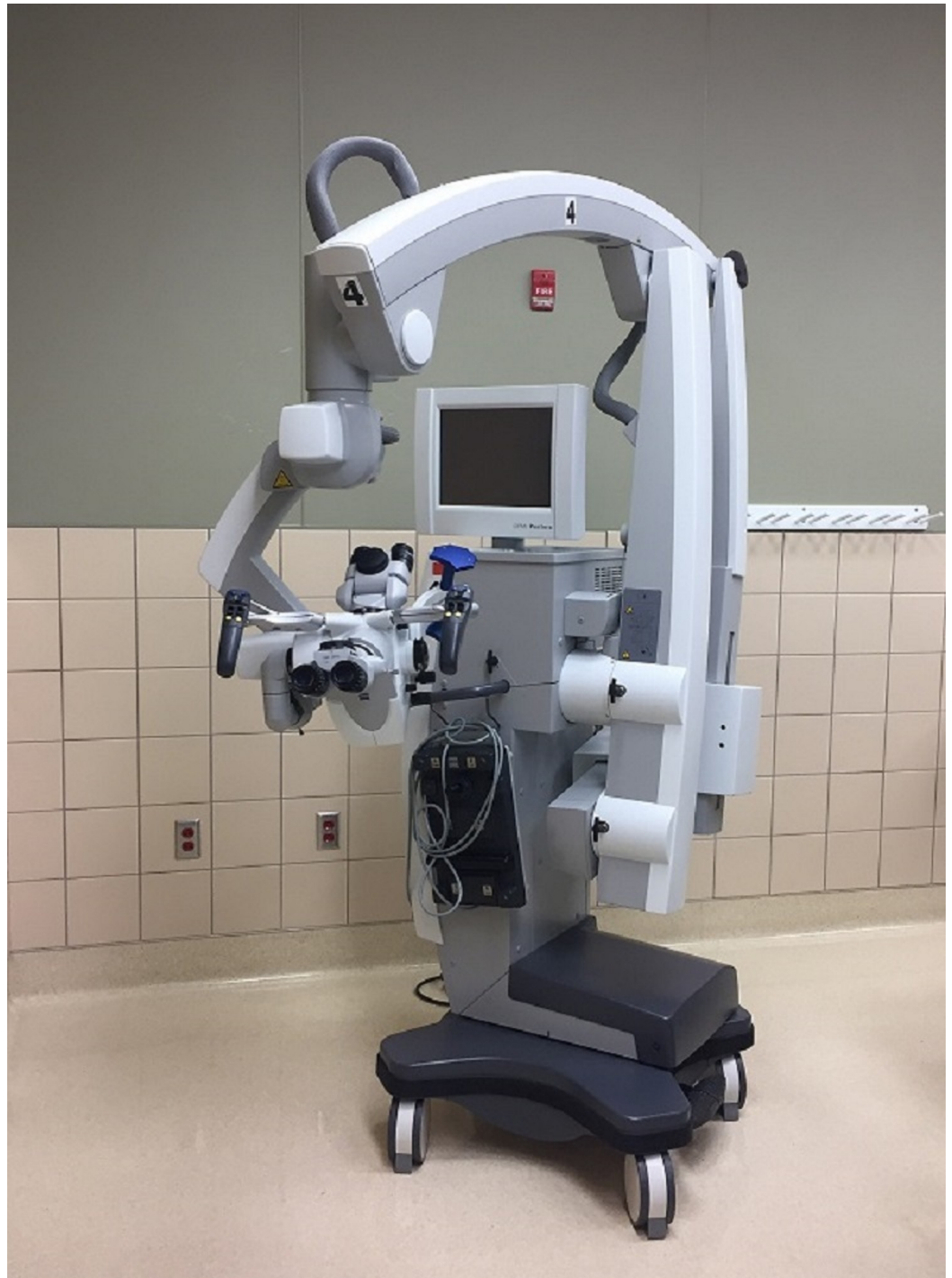
FIGURE 1: Zeiss Pentero Operative Microscope