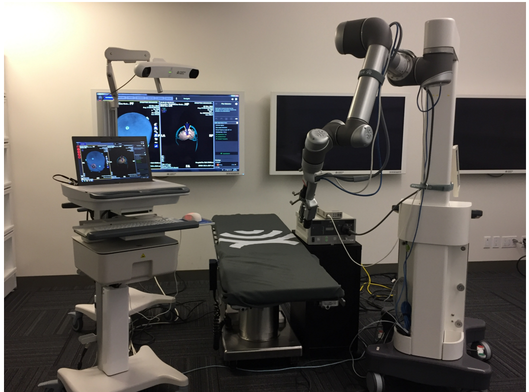
FIGURE 2: BrightMatter™ Servo system