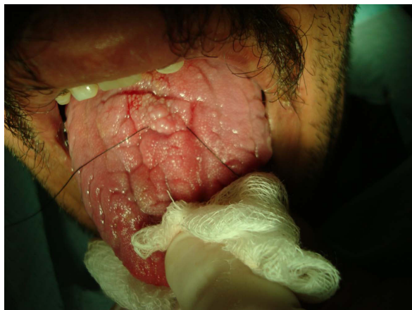
Figure 3 Oral findings in patient A4. Geographic tongue and the site of nodular lesion biopsy.