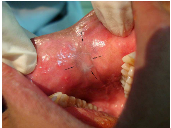
Figure 5 Oral findings in patient E8 showing white lesions (arrows) in the form of thin striations affecting the buccal mucosa.

F5: Seven year old girl with grade 1 gingivitis related to lower incisors.