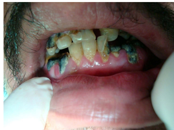
Figure 1 Oral findings in patient A4. Rampant caries and gingivitis.

E10: Eleven year old boy, and brother of E8 with grade 1 gingivitis and 8 carious deciduous teeth.