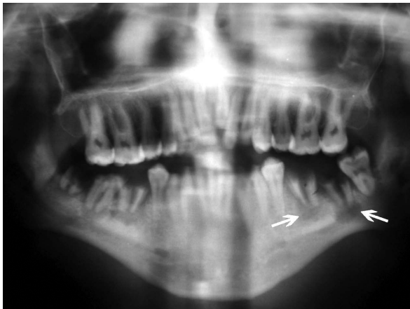
Figure 2 Oral findings in patient A4. A panoramic radiograph showing multiple periapical lesions related to lower molars (arrows).