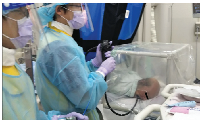
Figure 2. The shielding box was placed over the patient's head and shoulders. In addition, the box was covered with another transparent vinyl sheet, which shielded the windows and stuck to the box using adhesive tape.