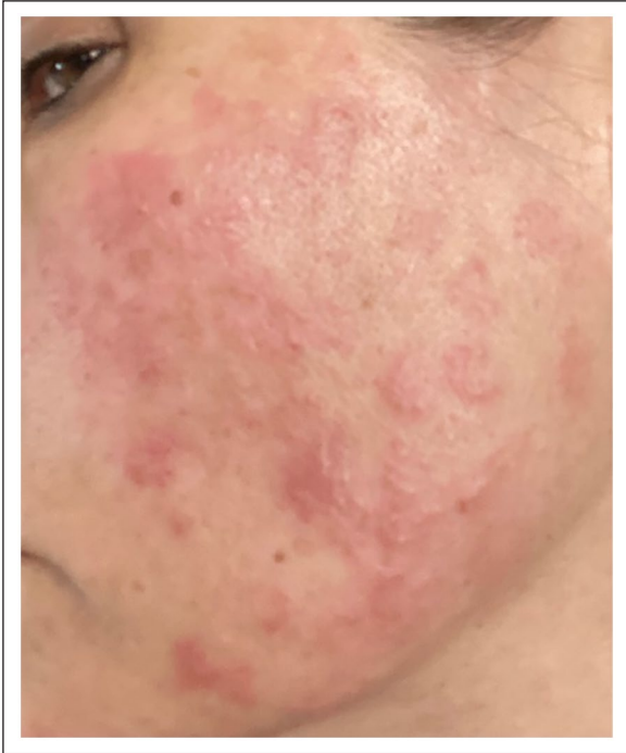
Figure 1. Ill-defined erythematous edematous annular plaques with no overlying superficial skin change on the left cheek.

demonstrated edematous erythematous annular plaques with no overlying superficial skin change on the left cheek (Figure 1). She had no lymphadenopathy.