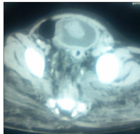
Figure 1: CT scan image shows soft tissue mass arising from dome of the urinary bladder.

Surgery was performed through a lower midline abdominal incision. Urinary bladder was defined by extraperitoneal approach. The tumor was palpated.