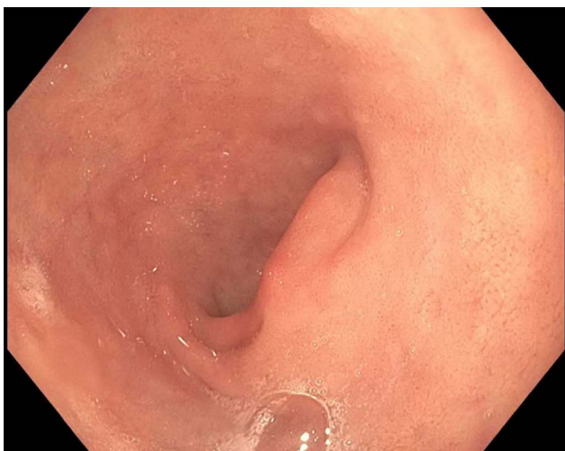
Figure 2. Duodenal bulb on follow-up esophagogastroduodenoscopy showed healed duodenal ulcer and no evidence of luminal mass.

One month following discharge, the patient presented to our outpatient endoscopy center for EGD/EUS. Follow-up EGD showed complete endoscopic healing of the previously seen duodenal ulcer and no evidence of intrinsic or submucosal luminal mass (Figures 2 and 3). However, EUS displayed a discrete, hypoechoic, 23.8 mm × 16.8 mm, extrinsic lesion in the duodenal bulb, without evidence of invasion