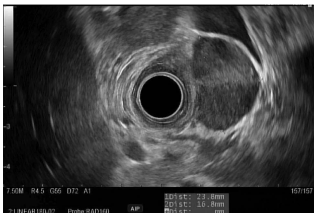
Figure 4. Endoscopic ultrasound in duodenal bulb showed a 23.8 mm × 16.8 mm submucosal, hypoechoic mass in the muscularis propria.

In this case, complete endoscopic healing of an upper GI bleed from a duodenal GIST was obtained with PPI therapy, yet a discrete mass lesion was identified on EUS. Initial EGD and CT findings could have easily been attributed to