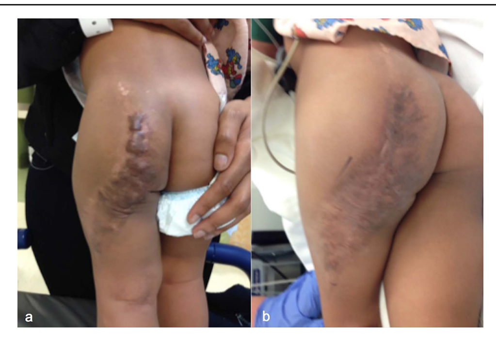
Figure 1. Case 1, a 4-year-old boy sustained superficial partial thickness scald burns to his right buttock and thigh, before treatment (a), and after treatment (b)

and titrated to a maximum energy of 90 mJ and 1% density. The beams cover a square size of 10 mm \times 10 mm or 1 cm<sup>2</sup>. The pattern should appear as a contiguous square grid with no overlap, unlike PDL. If the skin is charred, the char should be left in place, not removed. After fCO<sub>2</sub> AFR, we apply topical triamcinolone over the treated areas as a method of laser-assisted drug delivery, to a maximum dose of 80 mg, or 1 mg/kg. Full-field CO<sub>2</sub> is absolutely contraindicated in the treatment of burn scars because it results in a secondary burn injury that cannot re-epithelialize, except from the periphery.