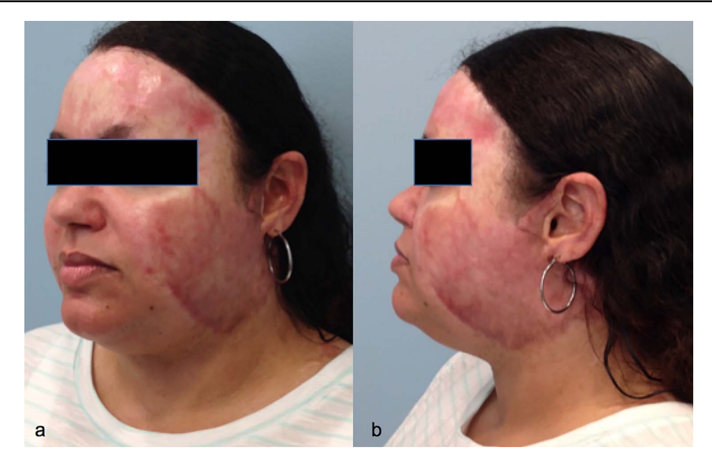
Figure 5. Case 4, a 36-year-old female sustained deep partial burns to her head and neck from a house fire. Oblique view (a) and lateral view (b) after treatment