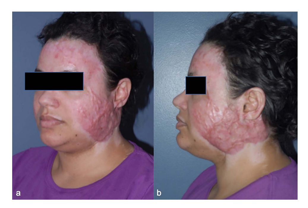
Figure 4. Case 4, a 36-year-old female sustained deep partial burns to her head and neck from a house fire. Oblique view (a) and lateral view (b) before treatment