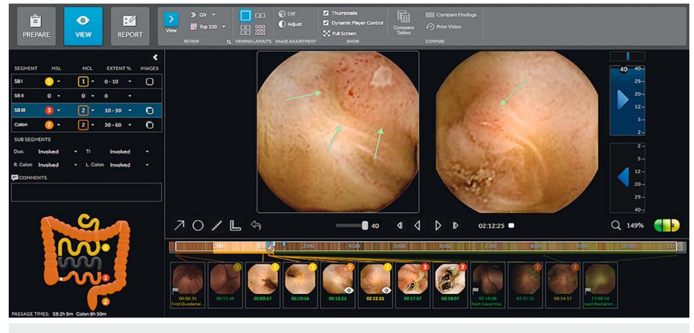
Fig.1 PillCam Crohn's system representative image of gastrointestinal table and map.

In recent years, a significant effort has been made to identify patients and categorize them into low versus high risk, and accordingly treat them step up or top down, as well as to explore the concept of achieving deep remission and mucosal healing [1]. Targets have been suggested by the international organization for IBD to achieve these goals: the treat to target concept [9].