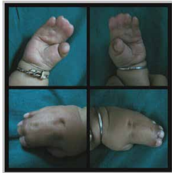
Fig. 2: Clinical photographs of hands: Upper left-right hand palmar, upper right-left hand palmar, lower left-right hand dorsal, lower right-left hand dorsal.

Both upper limbs showed (Figure 2) symmetric complete simple syndactyly of