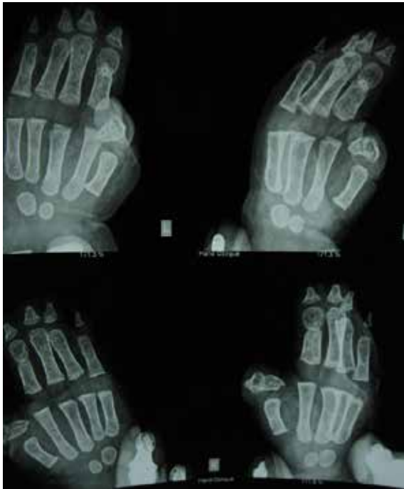
Fig. 4: Digital x-ray of both hands (AP and oblique views).

sided hemicoronal suture with radiologic confirmation of frontal plagiocephaly by cephalometric analysis. Right eye was found to be proptotic with shallow harlequin orbit due to elevated ipsilateral sphenoidal ridge. The ventricles were mildly dilated. Digital X-ray of hands (Figure 4) and feet corroborated the clinical findings of syndactyly with symphalangism. The thumbs showed presence of radially deviated