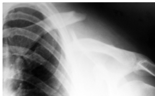
Figure 2. Radiography showing fracture of the clavicle.

Degeneration, given that she initially presented symptoms consistent with diagnosis of the Frontotemporal Dementia and evolved over time with symptoms compatible with Corticobasal Degeneration Syndrome.