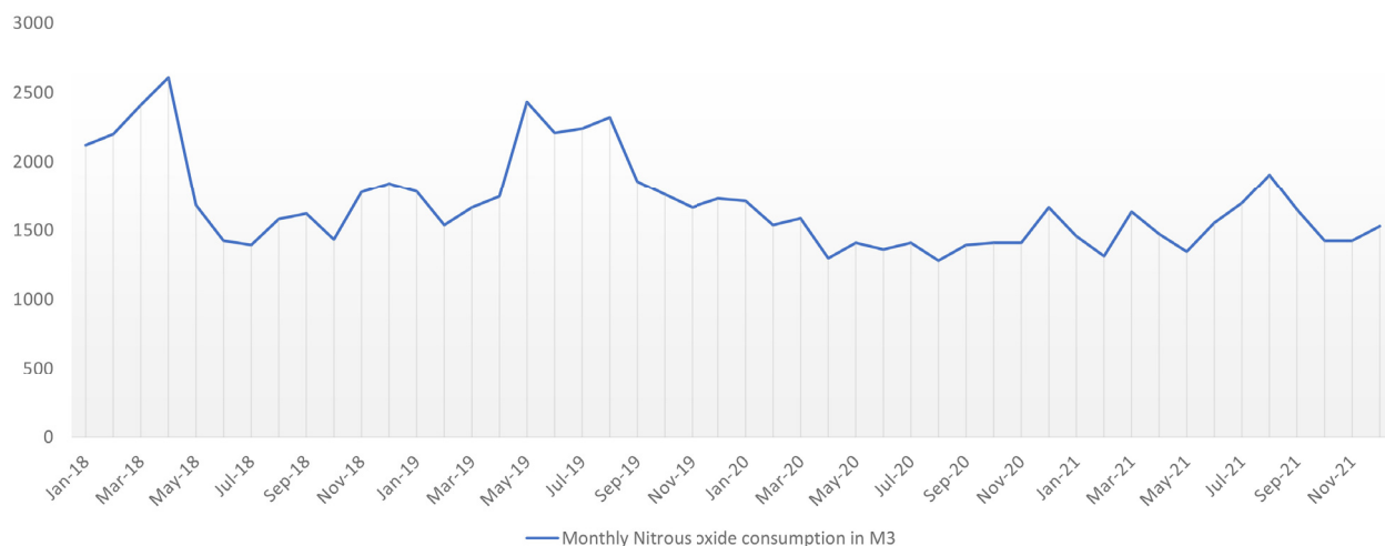
Fig. 2. 2 Monthly Nitrous oxide consumption in m³