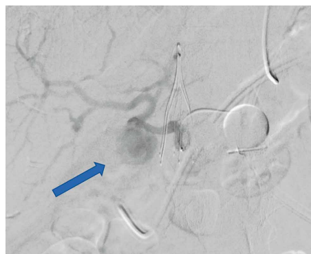
FIGURE 3: Angiography case 2, performed POD #54 showing hepatic artery pseudoaneurysm with active extravasation (arrow).

34 minutes, three hours five minutes, four hours two minutes and four hours seven minutes. Ages and cause of death of donors were as follows: 22 year old with head trauma; 45 year old with a central nervous system tumor; 32 year old with head trauma and 60 year old with anoxia after a cardiac event.