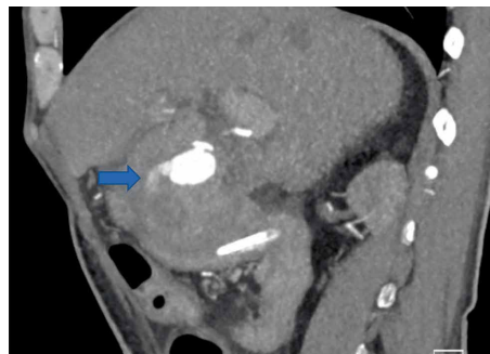
FIGURE 1: CTA case 1, performed POD #85 showing hepatic artery pseudoaneurysm with active extravasation (arrow).

All patients received grafts from deceased donors, with two donation after cardiac death (DCD) livers and two donation after brain death (DBD) livers. One patient who initially received a DCD graft was retransplanted with a DBD liver secondary to liver necrosis. One graft possessed a replaced right hepatic artery that was reconstructed ex vivo by anastomosis of the superior mesenteric artery to the celiac artery, while the other grafts had standard anatomy. The respective cold ischemic times for the liver transplants were two hours