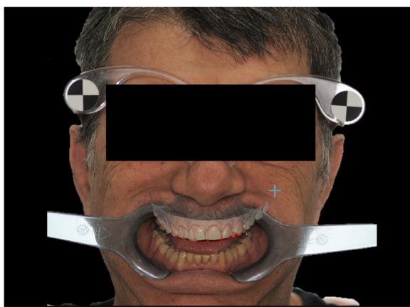
Fig. 4 3D smile virtual planning. A three-dimensional digital wax-up using as reference the outlines of the 2D smile design previously performed. The procedure was performed by using the DSS CAD software (DSS3D. Beta.12977, EGS Srl, Italy)

previously performed (Fig. 4). The derived .stl file of the digital wax-up was exported and sent to the digital lab for the realization respectively of mock-up (0.4 mm) in methacrylic photoreactive resin (Formlabs, Photopolymer Resin, Gray (GPWH02), Formlabs Inc. USA) and in polymethyl methacrylate (Synergy Disk Tempo Multi, Opal, Nobil-Metal SPA, Italy) (Fig. 5). For the purpose of the present investigation, the 3D printing machine used was the Formlabs form 2 (Formlabs Inc. USA), featuring SLA 3D printing technology. The milling machine used was the CORITEC IMES-ICORE 250i (imes-icore® GmbH, Eiterfeld, Germany) that featured a 5-axis system; the milling sequence of the workpiece involved three progressive internal and external steps of