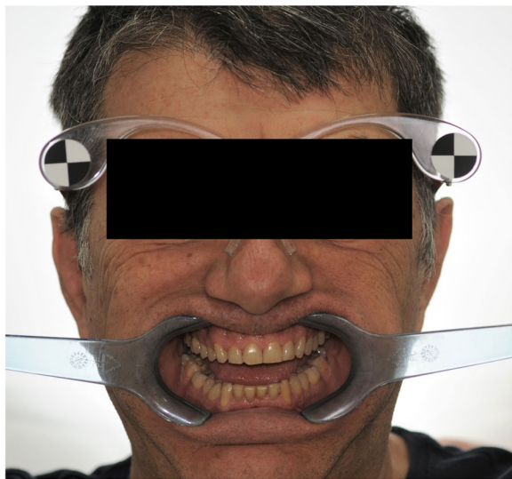
Fig. 1 Photograph of the patient's face with cheek retractors in place. The picture was taken with semi-disclosed dental arches, to correctly evaluate the parallelism between the bi-pupillary line and occlusal planes as well as and the congruence between the median and interincisive lines

Standardized photographic records were taken using camera D300 (Nikon Corporation, Minato-ku, Tokyo, Japan) equipped with AF-S VR Micro-Nikkor 105 mm f/2.8G IF-ED macro lens (Nikon Corporation, Minato-ku, Tokyo, Japan) and Metz 15 MS - 1 digital flash system, with LumiQuest pocket bouncer, on a Medical Close-up bracket (CLS Wireless Flash System). Subjects were instructed to be seated behind a line drawn on the floor while the camera was placed at a distance of 1.50 m from the patient and at the same height as the patient's face in a vertical position [28]. Subjects were asked to look at the camera in order to get the bipupillary plane