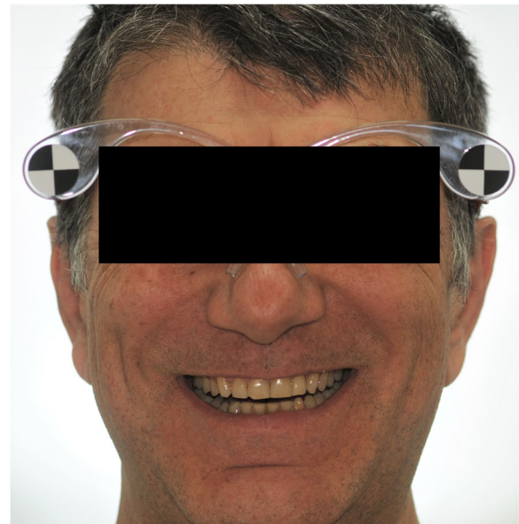
Fig. 2 Photograph of the patient's face without cheek retractors. The picture was obtained by asking patients to smile in order to evaluate the orientation of the incisal plane with respect to the curve of the lower lip, as well as the width of the lateral corridors

as parallel as possible to the horizontal plane. Subjects were asked to wear specific glasses equipped with an optical measurement system that allowed the clinician to consistently place the photographic markers over the camera digital grid. Also, the photographic markers provided the conversion of pixels into mm, in order to consistently calibrate the images used during the virtual planning flow. This method increases the reliability of multiple images acquisition as well as the trueness in the subsequent virtual smile design process.