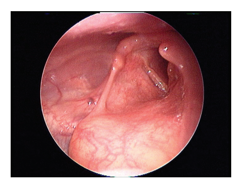
FIGURE 3: Fiberoptic laryngoscopy revealed a complete healing of the vocal cord. Laryngeal morphology and motility were preserved.

Cellular proliferation index evaluated with Ki67 antibody was <1%.