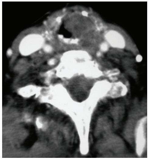
FIGURE 1: Axial CT scan showed an expansive mass occupying glottic space, originating from the left aryepiglottic fold.