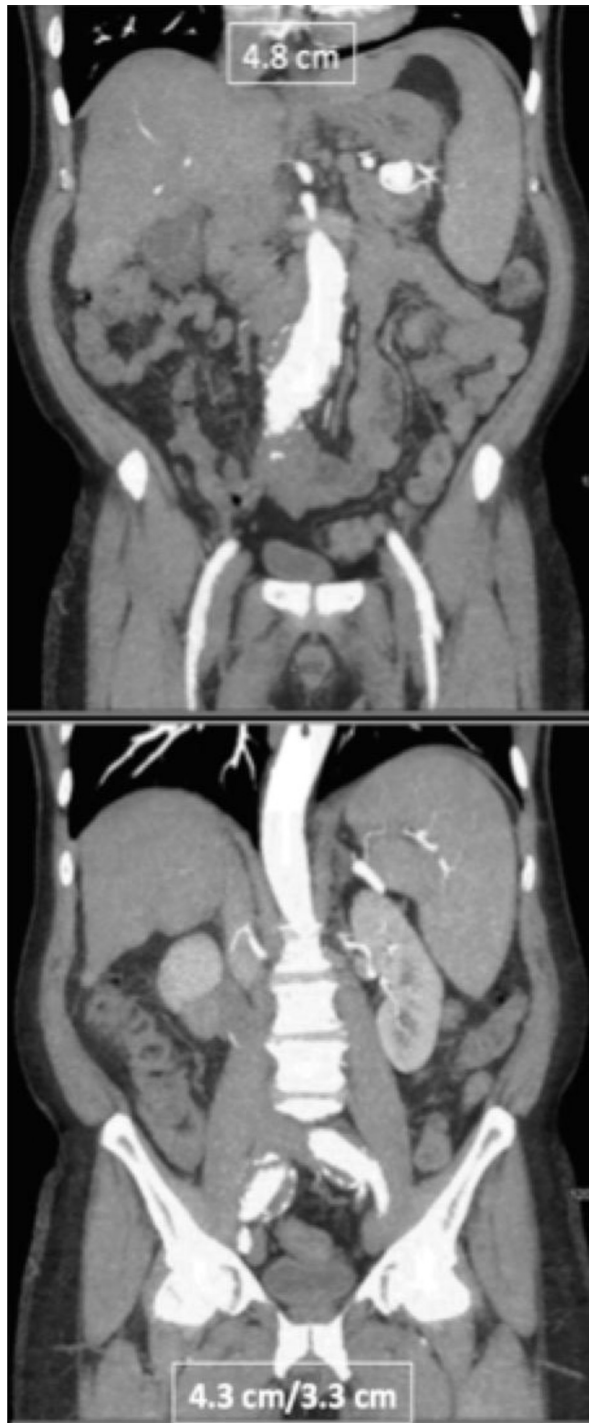
Fig 3. Computed tomography angiography of the abdomen and pelvis, June 2014.

often prompting aneurysm repair at an earlier time than would otherwise be considered. There is no prevailing explanation for aneurysmal growth with chemotherapy use; however, some have questioned altered generation of DNA, collagen and elastin, release of inflammatory markers, and disturbance in smooth muscle proliferation. 12 In theory, TACE is a localized treatment and should not have systemic effects, as are believed to be seen with other cytotoxic treatments, but this first documented incidence indicates a need for further review and awareness.