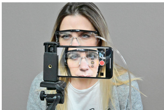
Fig. 1 Standardized quantitative measurement of the orbicularis oculi reflex triggered dynamically with an air stream. The patients wear protective glasses. On the left side, there is a circular opening (7 mm diameter). An air hose is inserted into this side opening of the glasses. This is connected to an oxygen bottle, from which oxygen flows constantly at 7 l/min. The air flow served as a standardized stimulus for the activation of the orbicularis oculi reflex. To quantitatively record the blink frequency as a reflex response, the eyelid closures were filmed with a video camera through the protective glasses and documented in a standardized way (eyelid closures per minute)

Group A came to the study appointment with active stimulation and the ON-phase measurement took place first. After completion, the ONS device was switched off. The OFF-phase measurement was made after 1 h. Group B patients switched off the ONS 12 h prior to the