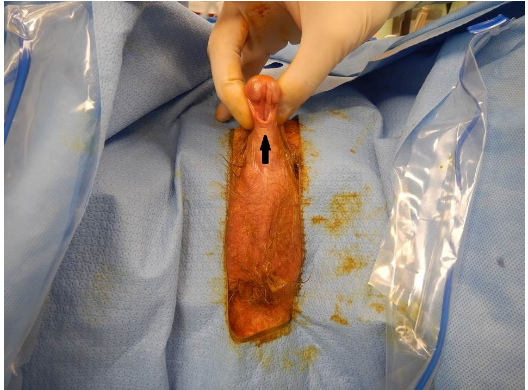
FIGURE 1: Patient's external genitalia

abdominal surgical procedure as a very young child. The patient reported puberty at age 14, normal sexual activity and regular erections up to two months prior to presentation. The urology service attempted to perform bedside cystoscopy, which demonstrated a normal distal urethra and obliteration of the entire lumen on entrance into the bulbar urethra. A computed tomography (CT) scan was performed showing bilateral adrenal masses consistent with myolipomas unchanged in size from a 2001 CT scan and an enlarged pelvic mass arising from what was thought to be the adnexa compressing the urinary bladder. On physical examination, the patient was noted to have hypospadias and absent testicles (Figure 1). The patient had undergone an unknown procedure as a child but did not have any further information about his medical history and no further follow-up was ever done per the patient report.