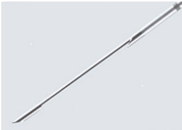
Fig. 1. Tip of a trucut fine-needle biopsy needle (QuickCore® needle; Cook Medical, Inc., Winston-Salem, NC, USA).

of negative or indeterminate diagnoses based on EUS-guided tissue sampling findings in the presence of suspected pancreatic malignancy, recent guidelines recommend either performing revision on the initial pathology specimens obtained or repeating EUS-TA. For pancreatic cystic lesions with worrisome features, including clinical symptoms of pancreatitis, cysts measuring more than 3 cm, enhancing mural nodules measuring less than 5 mm, thickened/enhancing cyst walls, main duct size of 5–9 mm, abrupt change in the caliber of the pancreatic duct with distal pancreatic atrophy, lymphadenopathy, increased serum CA19-9 level, and cyst growth rate of more than 5 mm every 2 years, the European Society of Gastrointestinal Endoscopy (ESGE) recommended EUS-TA for biochemical and cytological evaluations. At first, only EUS-FNA needles measuring either 19 or 22 to 25 G were available for tissue acquisition. 13 EUS-FNB needles were introduced thereafter owing to the limitations of EUS-FNA needles.