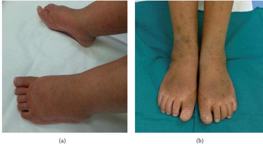
FIGURE 2: Patient legs and feet delaying pump recharging of 4 days (a) and after one week of pump recharging with usual dosage of Ziconotide (b).

severe chronic pain who are intolerant of and/or refractory to other analgesic therapies. Ziconotide is the synthetic equivalent of a 25-amino-acid polybasic peptide found in the venom of the marine snail Conus magus [14]. The mechanism of action of Ziconotide involves a potent and selective block of neuronal N-type voltage-sensitive calcium channels at the presynaptic level [15, 16], thereby inhibiting neurotransmission from primary nociceptive afferents. Ziconotide produces potent antinociceptive effects in animal models [17] and its efficacy has been demonstrated in human studies [18]. The analgesic efficacy of Ziconotide likely results from its ability to interrupt pain signaling at the level of the spinal cord. Importantly, prolonged administration of Ziconotide does not lead to the development of addiction or tolerance [19].