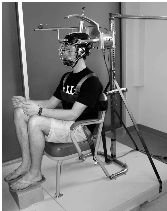
Figure 1 Custom-built fixed-frame dynamometer. the helmet restraint structure is appended to a 6 degree of freedom load cell (LC) for measurement of efforts exerted in different directions.

A custom built, fixed-frame static dynamometer was used to simultaneously record force and EMG measures during MVCs of the neck muscles (Figure 1). The device consists of a load cell coupled to a semi-spherical aluminum structure used for attachment of a hockey helmet incorporating a face mask (Bauer Nike, St. Jerome, Quebec, CA). The position of the helmet in the sagittal plane as well as the height of the load cell and the distance of the chair relative to the load cell can be adjusted to accommodate individual subject anthropometrics. Subjects' perform testing while seated and firmly restrained. Subjects-exerted neck