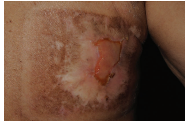
FIGURE 1. Typical presentation of cardiac fluoroscopy-induced radiation dermatitis before ulceration. An 81-year-old man presented with a painful sharply demarcated concentric target-like patch. A central erosion with a peripheral white sclerotic zone and an outer hyperpigmented "flame burn-like" zone.

dependent on multiple factors. For example, a higher radiation emission rate (up to 0.2 Gy/min) will occur automatically decided by computer setting when operators require higher image resolution or when the radiation needs to pass a longer distance through human body. Therefore, the actual cumulative radiation dose is usually underestimated, if we use only the procedure time (or fluoroscopy time) to calculate it.