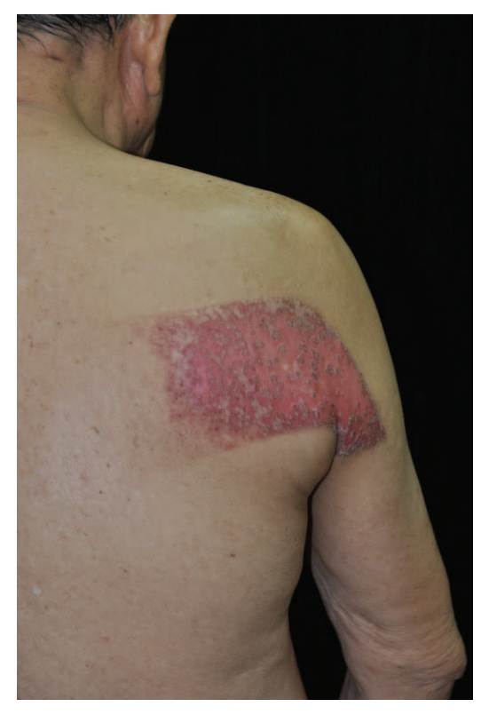
FIGURE 2. Radiation dermatitis mimicking contact dermatitis. An 82-year-old man presented with an itchy painful sharply demarcated rectangular erythematous patch with dry fish scale-like desquamation on right subscapula, auxiliary and inner arm. The initial clinical diagnosis was contact dermatitis.

dependent on multiple factors. For example, a higher radiation emission rate (up to 0.2 Gy/min) will occur automatically decided by computer setting when operators require higher image resolution or when the radiation needs to pass a longer distance through human body. Therefore, the actual cumulative radiation dose is usually underestimated, if we use only the procedure time (or fluoroscopy time) to calculate it.