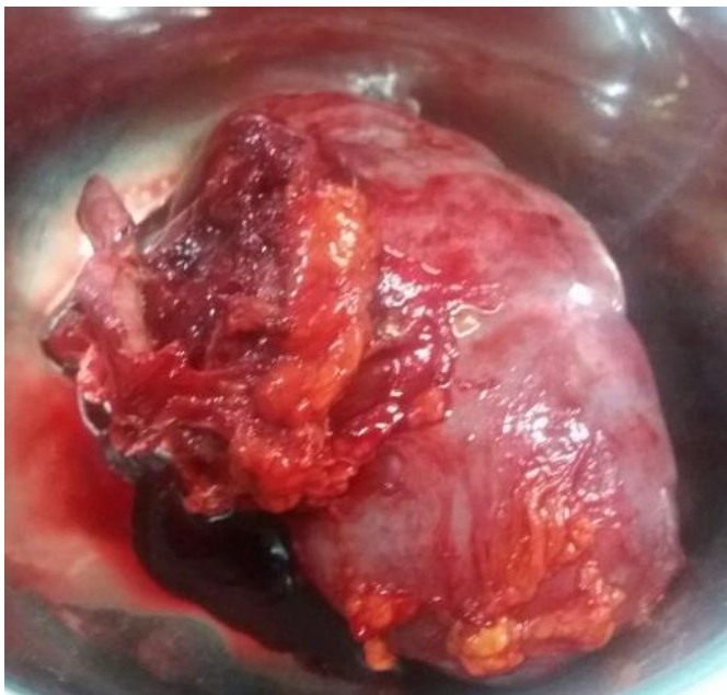
Figure 2: Right kidney with solid mass in the hilar region