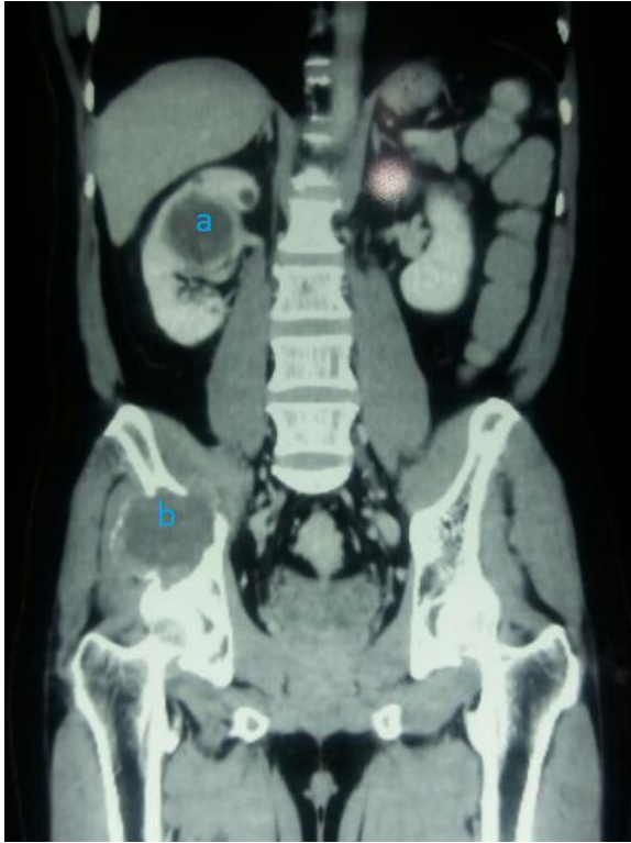
Figure 1: CT scan showing both (A) right renal and (B) pelvic tumours