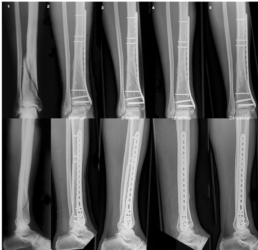
Figure 2 Distal tibia fracture of a 67-year-old man treated with a distal tibia LCP and DLS 3.7 in the proximal fragment. Distal tibia fracture: postoperative (1), six-weeks follow-up (2), three-month follow-up (3), and six months follow-up (4) with complete consolidation.

formation at cis-cortex and trans-cortex (“minus”, “plus”, “plus/plus”) and status of consolidation of the fracture (“yes”, “no”). The pictures were blinded for the used implants or screws.