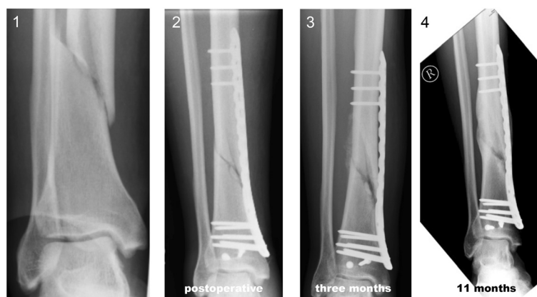
Figure 1 Distal tibia fracture of a 38-year-old man treated with a distal tibia LCP and conventional locking screws. Distal tibia fracture: postoperative (1), six-weeks follow-up (2), three-months follow-up (3), and eleven-months follow-up (4), with incomplete consolidation.

For the evaluation of the status of fracture healing, the two-plane radiographs of each patient after 3, 6, 12 and 24 weeks were analyzed by two trauma surgeons who had not participated in the earlier stages of this study. The following parameters were assessed: callus