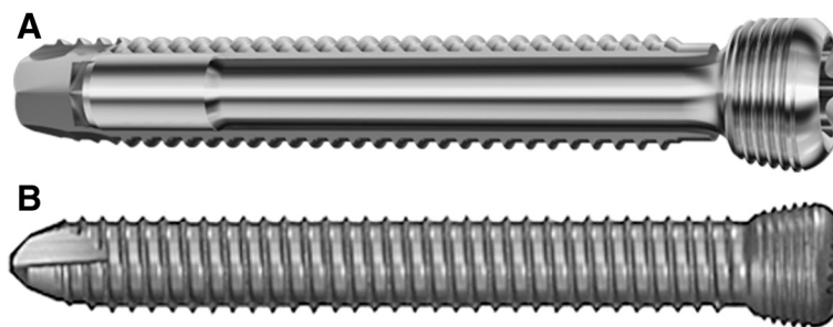
Figure 3 A. PIN Sleeve Design of the Dynamic Locking Screw (DLS 3.7). B Locking Head Screw (LHS 3.5).

of standard locking screws and eliminates the tension on the bone and the compression between the plate and the bone, while simultaneously retaining the blood circulation and protecting the periosteum from potential damage. The DLS 3.7 consists of a pin with a threaded screw head which is connected to a threaded sleeve based on the angular-stable technique of Locking Screws (Figure 3). The DLS 3.7 is made of a Cobalt-Chromium-Molybdenum alloy (CoCrMo). The material of the screw