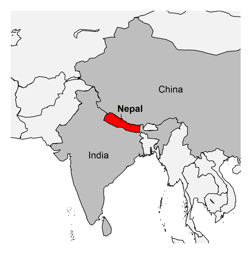
Figure 1. Nepal, in red, bordered by India in the south, and China in the north. doi:10.1371/journal.pntd.0002634.g001