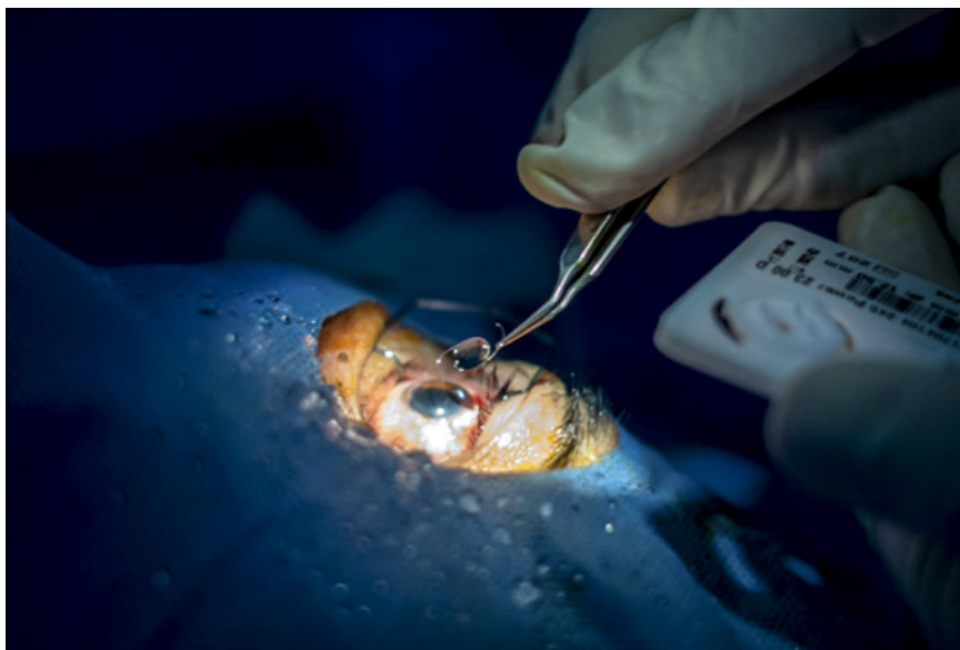
Monitoring surgical quality allows clinicians and administrators to identify issues and take action to improve practice, outcomes and performance. LAOS

A successful cataract outcome monitoring and continuous quality improvement system will assist practitioners and centres to identify and implement ongoing improvements in eye care delivery.