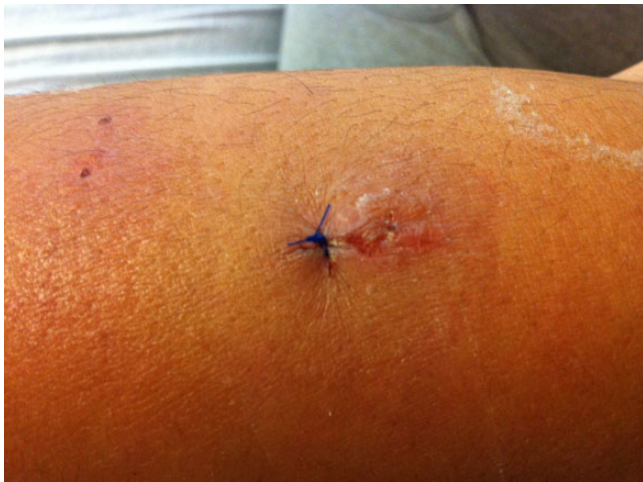
Figure 2: Erythematous papule with scaling and small scab on top from excoriation, suture (blue color) noted where biopsy was taken, and two small macule clusters of erythema seen in the top left corner with small scabs from excoriation.

chlamydia, human immunodeficiency virus (HIV), Babesia , blood cultures, Ehrlichia , lyme and Coxsackie titers were negative. She had a positive varicella, parvovirus, herpes simplex virus (HSV) 1 and 2 IgG, but negative IgM. Smears done from vesicular fluid were negative for herpes and varicella virus. A biopsy was done with dermatology. Tissue obtained were negative for herpes virus DNA and showed subepidermal edema, spongiosis, rare dyskeratotic keratinocytes and superficial and deep perivascular lymphocytic infiltrates with admixed histiocytes and neutrophils consistent with a PMLE (Figs 3 and 4). There were no sign of vasculitis, fungal elements or prominent mucin to suggest connective tissue disease. Given her abrupt onset of symptoms, a connective tissue disorder was less likely, but a full workup was done with rheumatology input, which revealed negative anti-nuclear antibody, rheumatoid factor, anti-