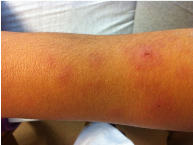
Figure 1: Erythematous clusters of macules and papules on the right arm, small excoriation seen on the top right hand side.