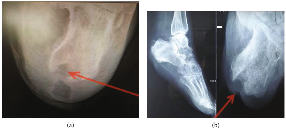
FIGURE 3: Clinical radiographies of diabetic heel ulceration (a) before surgery and (b) 12 weeks after surgery. The arrow head is pointed on the calcaneus.