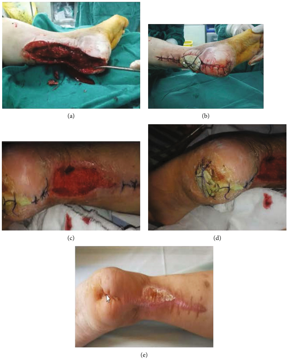
FIGURE 4: Diabetic heel ulceration. Diabetic heel ulceration (a) during surgery, (b) immediately after surgery, (c, d) 3 weeks after surgery, and (e) 12 weeks after surgery.