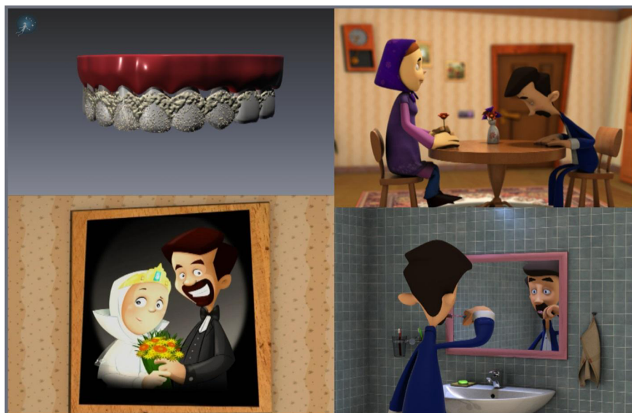
Figure 1 Selected pictures from the campaign.

'Dental plaque', 'Excessive use of antibiotics', 'High sugar consumption' and 'Don't know'. The third question was about the early sign of gum disease with the following response categories: 'Tooth discoloration', 'Tooth mobility', 'Tooth abrasion', 'Red gingival' and 'Don't know'. Each item was scored on the basis of true and false responses where true was scored = 1, and false and don't know = 0. The total score ranged from 0 to 3 with higher score indicating a better condition.