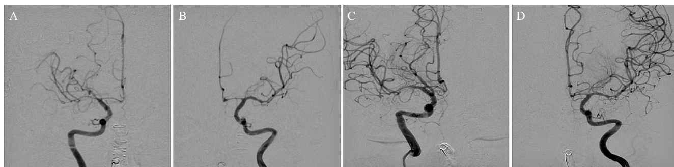
Fig. 2 Carotid angiography (CAG) shows narrowing of the anterior cerebral artery (ACA) and middle cerebral artery (MCA) (A, right; B, left). CAG after fasudil hydrochloride injection shows good dilatation of bilateral ACA and MCA (C, right; D, left).

cerebral edema, hydrocephalus, and cerebrovascular complications. 2,4 Cerebrovascular complications are common, but severe cerebral vasospasm that causes ischemic injury is rarely reported. 5 Conversely, postmortem histopathological evaluation of patients who died of acute bacterial meningitis suggests that the occurrence of cerebral vasospasm is more frequent than reported. 6 The pathogenesis of cerebral vasospasm in bacterial meningitis has not been elucidated and it is likely that inflammatory cytokines, leukocytes in the cerebrospinal fluid, and spasm-induced free radicals are involved. 7-9