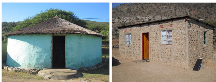
Figure 1 Two predominant types of traditional home construction in Tugela Ferry. A. Round-shaped home with thatched roof B. Box-shaped home with metal roof.

Two hundred eighteen ventilation measurements were conducted in 24 homes; 12 round-shaped huts with thatched roofs and 12 box-shaped homes with metal roofs (Figure 1). The structural and environmental characteristics of the homes are shown in Table 2. Compared to box-shaped, round homes had greater room volumes (91.3 m 3 vs. 36.6 m 3 , p < 0.001 ), were more likely to have cross-ventilation (10 vs. 2 homes,