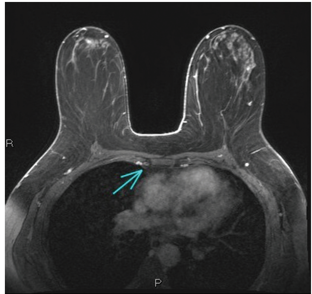
Fig. 1 Axial plane, postcontrast magnetic resonance image of a right-sided internal mammary lymph node in the second intercostal space, which measures 8 × 3 mm. The low intensity fatty hilum is clearly seen (arrow).

For characterizing malignant axillary lymph nodes, ultrasound was found to be 94% sensitive and 72% specific. Sonographic criteria were based on size, long axis/short axis (L/S) ratio, thickness of the cortex, and morphologic features (absence or presence of fatty hilum). 7 Normal hilar fat has increased signal intensity on nonfat-saturation MRI sequences and decreased signal intensity on fat-saturation MRI sequences (→ Fig. 1). Loss of hilar fat by the invasion of malignant cells is also a good predictor of malignancy. Another useful criterion is L/S ratio that has been shown to be 97% specific for malignancy with values less than 2. 8 Using these features, the suspicious axillary node could be detected with a high sensitivity and specificity by ultrasound, computed tomography, or MRI. In addition to these, since easily approached, ultrasound-guided fine-needle aspiration (FNA)