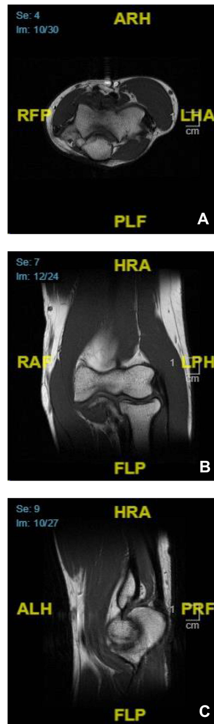
Figure 2 Right elbow MRI. No evidence of soft tissue mass or abnormal marrow signal: axial view (A), coronal view (B), and sagittal view (C).

The diagnostic value of immunohistochemistry in SS diagnosis is limited; however, a combination of EMA, BCL-2, and CD56 is commonly observed. CD99 staining may be positive in SS, and more recently TLE-1 immunohistochemistry has been used to help diagnose SS. Due to