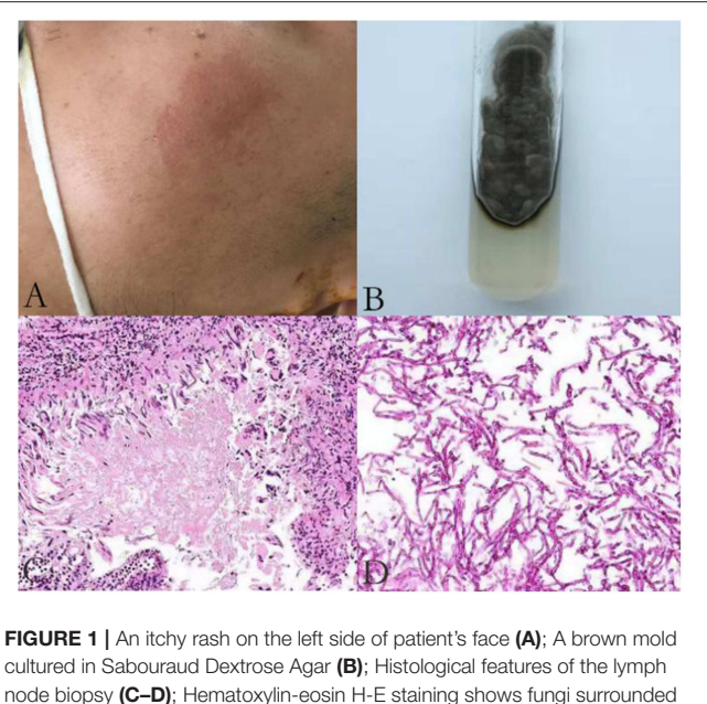
cultured in Sabouraud Dextrose Agar (B); Histological features of the lymph node biopsy (C–D); Hematoxylin-eosin H-E staining shows fungi surrounded by an epithelioid and giant cell granuloma (original magnification ×200) (C); H-E staining demonstrates infiltration of fungi without granuloma to another area of the biopsy sample (original magnification ×400) (D).

Exophiala dermatitidis (encountered worldwide, however, common in East Asia), also called Wangiella dermatitidis , is an emerging dematiaceous fungus associated with high mortality rates in both immunocompromised and competent hosts (2, 3). Cerebral phaeohyphomycosis is limited mostly to individuals of East Asian ethnicity. CARD9 is a caspase recruitment domain (CARD)-containing protein recently reported to be involved in invasive fungal diseases (4). We present the first reported case of cerebral phaeohyphomycosis caused by E. dermatitidis in a CARD9 -deficient Chinese patient.