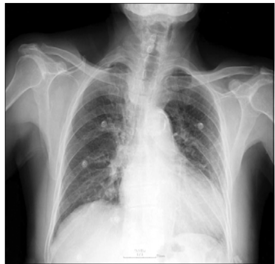
Fig. 1. This figure shows the preoperative simple chest radiography.

During the evaluation, the patient complained of mild chest pain. Preoperative chest radiography showed cardiomegaly and aortic arch calcification (Fig. 1). Electrocardiography showed a normal sinus rhythm. Echocardiography showed an ejection fraction of 31%, severe aortic valve stenosis ( V_{max}=5.26 m/sec, mean pressure gradient [PG]=69.4 mmHg, aortic valve area by continuity equation=0.6 cm 2 ) and mild to moderate mitral valve regurgitation (proximal isovelocity surface area radius=0.7 cm). Coronary angiography showed no