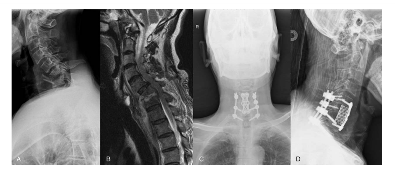
Figure 2. A 48-year-old man was diagnosed as having cervical tuberculous spondylitis (C6–7). X-ray, MRI showed the destruction of vertebral bodies of C6–7 (A–B). Final follow-up radiographs showed good bone fusion (C–D). MRI=magnetic resonance imaging.

The patients were administrated the following antituberculosis drugs: isoniazid (5 mg/kg), rifampicin (15 mg/kg), ethambutol (15-25 mg/kg), and pyrazinamide (15-30 mg/kg) before the surgery. ESR and temperature were confirmed to be normal or significantly decreased prior to commencement of the surgical procedure. Immediate surgery was recommended for patients with a sudden onset of complete paralysis or respiratory obstruction due to a large abscess. Enhancement of nutrition and correction of anemia and hypoproteinemia were routinely