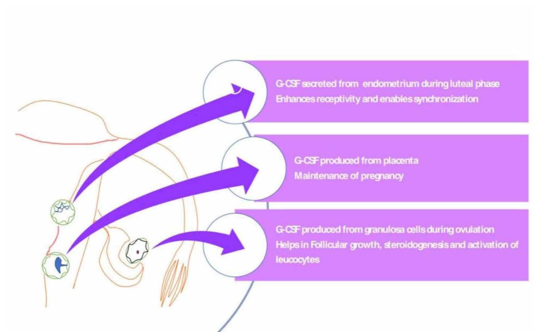
FIGURE 1: Sites of production of G-CSF in the reproductive tract

embryonic development, although granulocyte-macrophage colony-stimulating factor (GM-CSF) is the main component involved. Thus, G-CSF exerts its influence at various levels of the implantation process, making it an attractive diagnostic and therapeutic tool [30] (Figure 2).