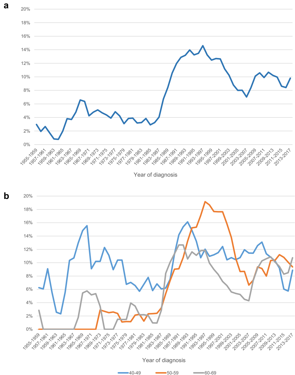
Figure 2. Proportion of in-situ breast cancer to in-situ and invasive breast cancer in 40–69 years old women during the time period 1955–2017 (a) and comparison of the age groups 40–49, 50–59 and 60–69 years (b).

50 years, except for selected genetic subgroups 22 . The incidence of in situ carcinomas quadrupled in 1987 at the beginning of population breast cancer screening. It is of interest that the increased proportion of in situ carcinoma to all breast cancer was seen mainly for women over 50 years of age and not for women under age 50. However, the numbers are very small and random variation prominent. In situ carcinomas represent around 8% of all breast carcinomas today in Iceland.